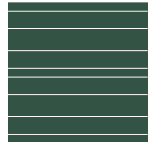
english school line

permanently printed and fused on ceramic surface.