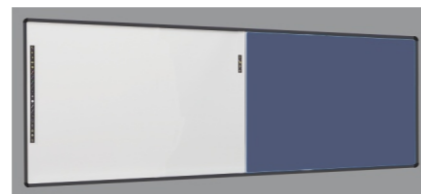
ēno flex 1