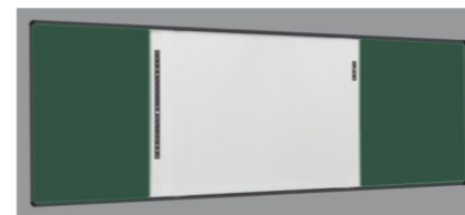
ēno flex 2