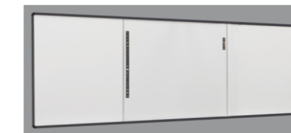
ēno flex 4