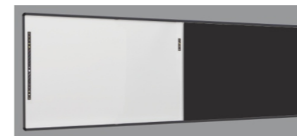
ēno flex 3